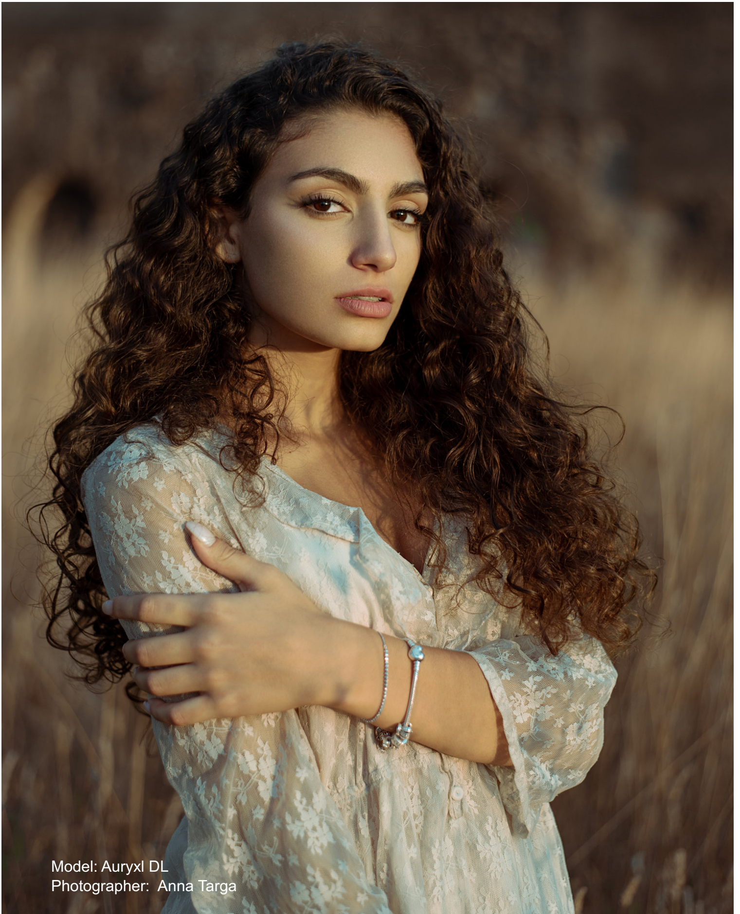
Model: Auryxl DL Photographer: Anna Targa